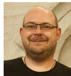
Phil Harper Children and Families Minister