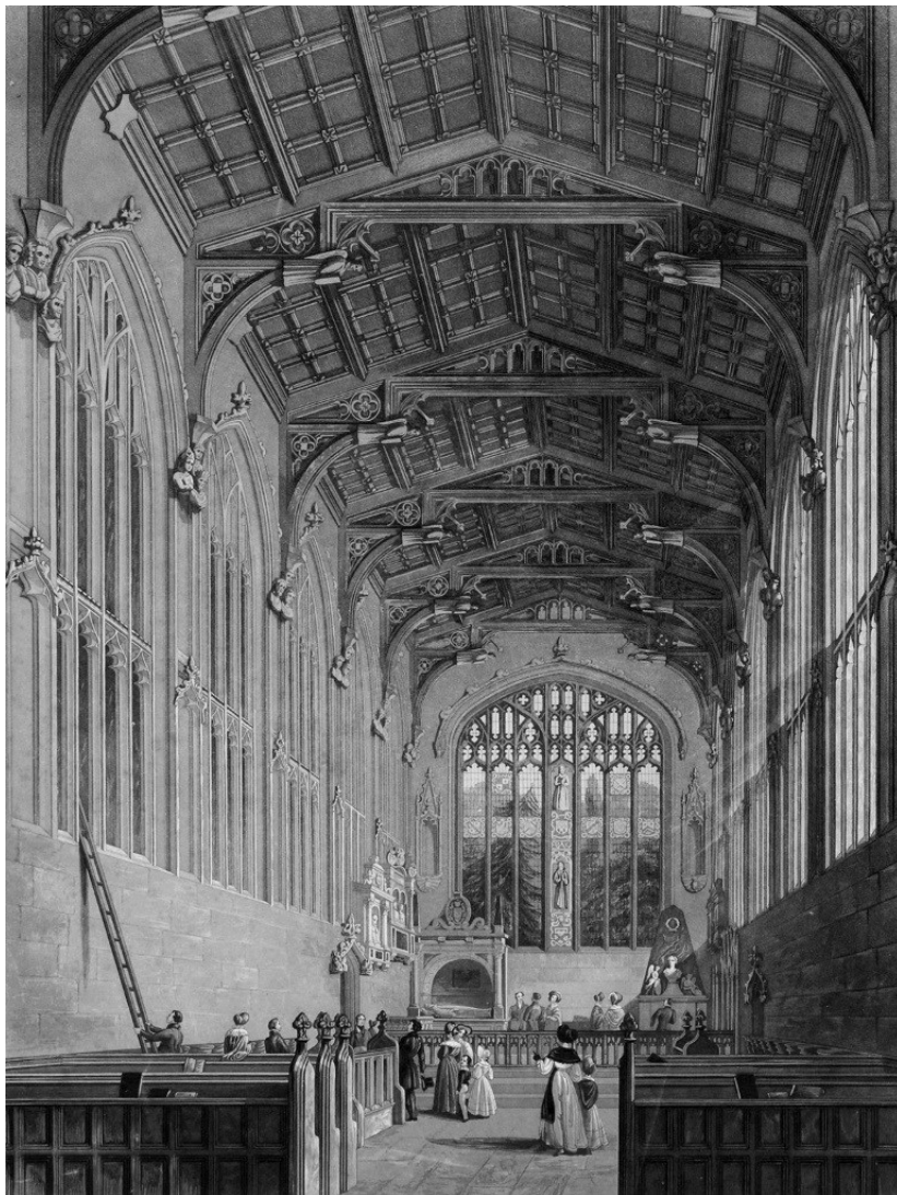
Chancel of the Parish Church of Stratford upon Avon