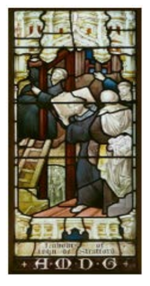
1. Building the chantry chapel

Before Shakespeare, John de Stratford was without question Stratford's most celebrated son.