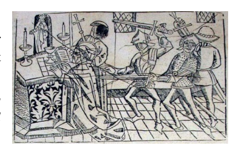
10. Defaced picture of Becket's murder

to be esteemed, named, reputed, nor called a saint ... his images and pictures .... shall be put down and avoided out of all churches, chapels and other places.