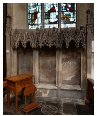
13. Canopied sedilia on south wall