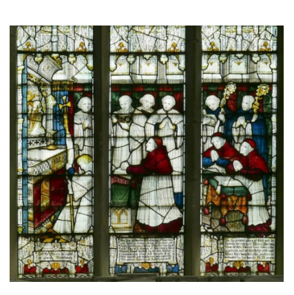
14. Stained glass window above sedilia