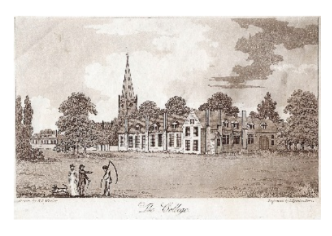
9. The Ecclesiastical College

Because it was dedicated to Thomas Becket, one of the most popular medieval saints, the chapel attracted many pilgrims from the Stratford locality and much further afield, which placed a strain on its resources and created a great deal of work for the priests.