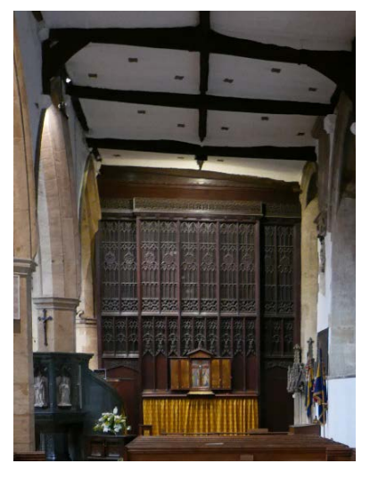
12. Becket Chapel today

A simple modern Becket chapel now replaces its magnificent medieval ancestor; it houses a memorial recording the names of the fallen in WWI.