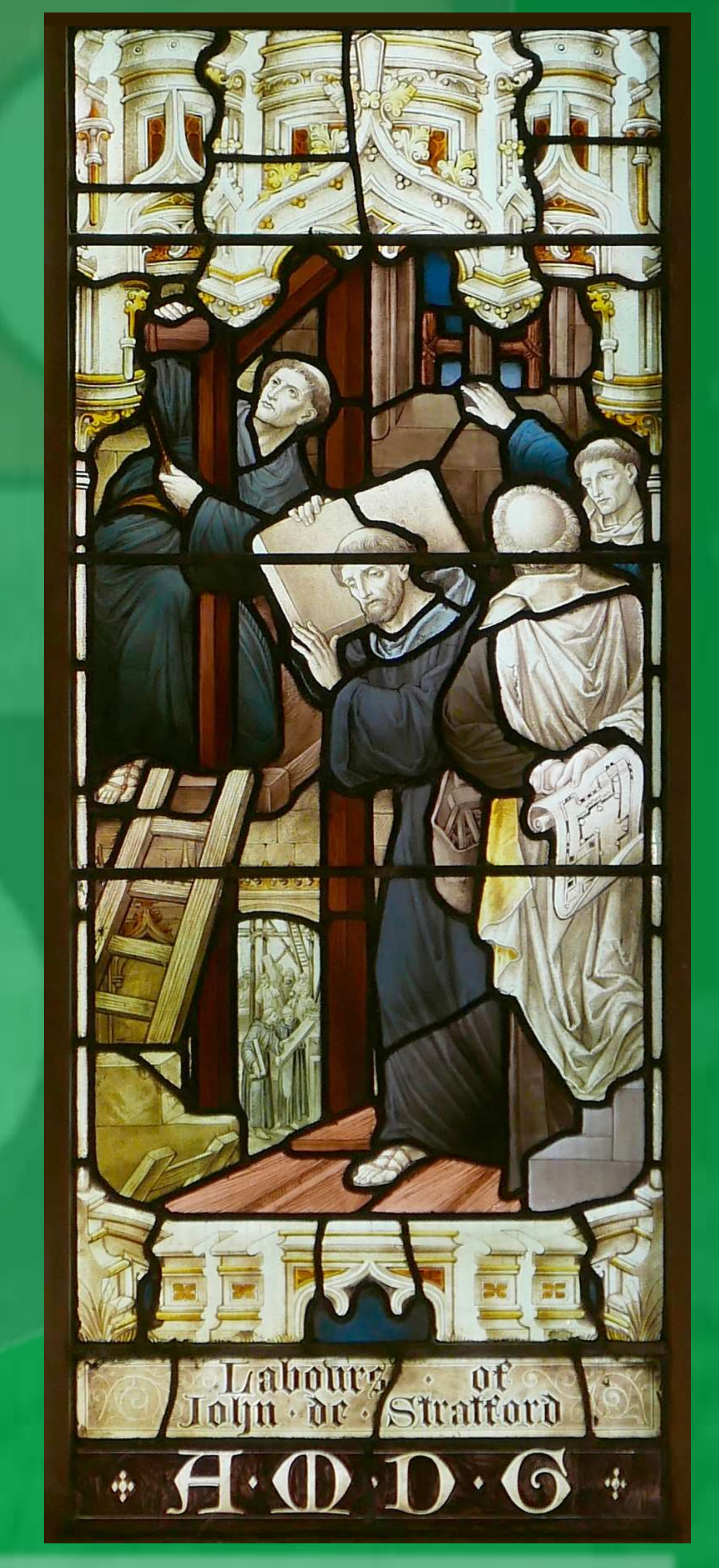
The labours of John de Stratford in building the Becket Chapel. In the American Window, St. Peter's Chapel ( Background : John de Stratford's crest as Archbishop)